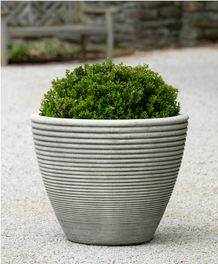
Shown in Greystone