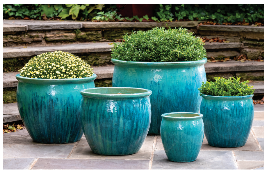
Shown in Antigua