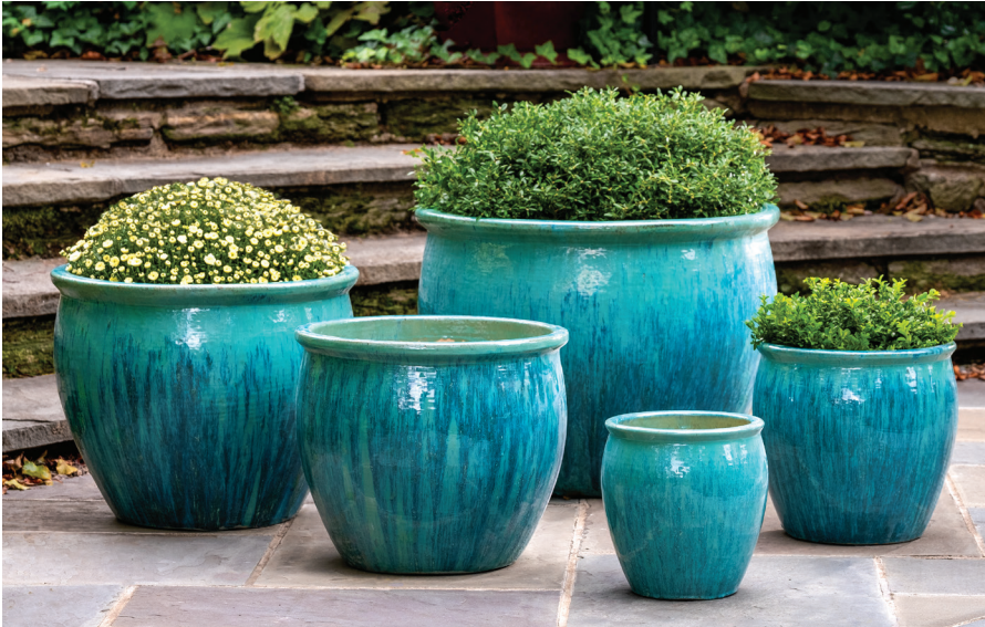
Shown in Antigua