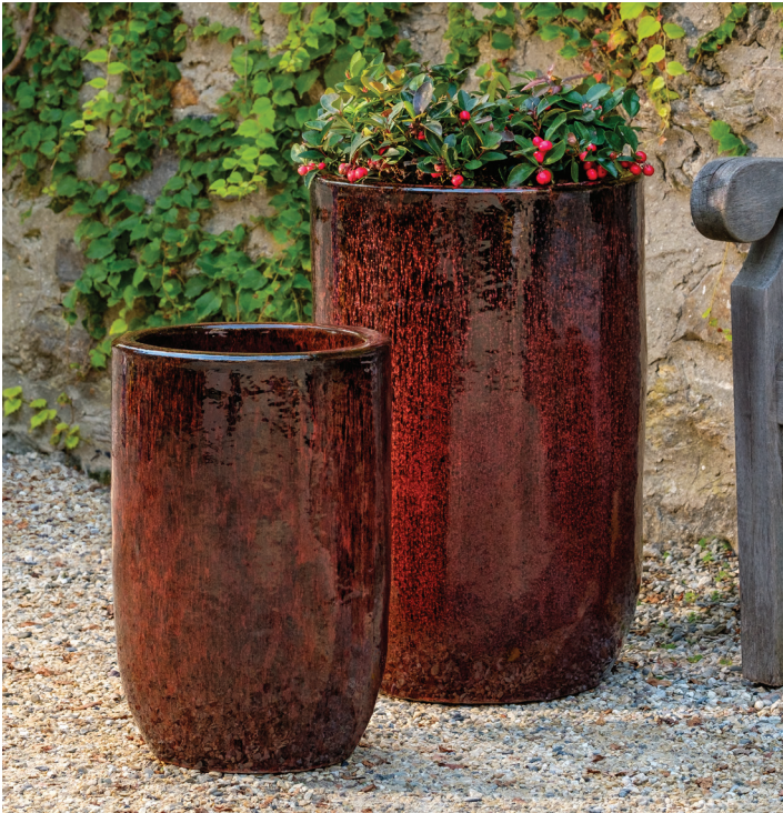
Shown in Cabernet