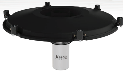
1-PIECE FLOAT ON 5HP VFX