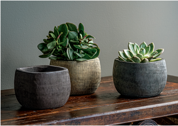
Shown in Assorted Glaze