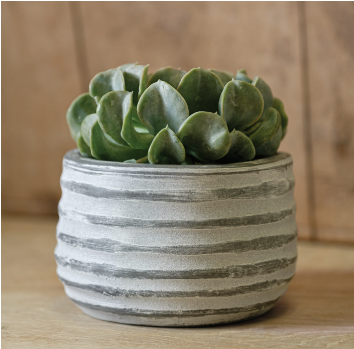
Shown in Grey and Whitewash