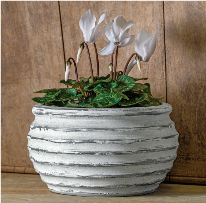
Shown in Grey and Whitewash