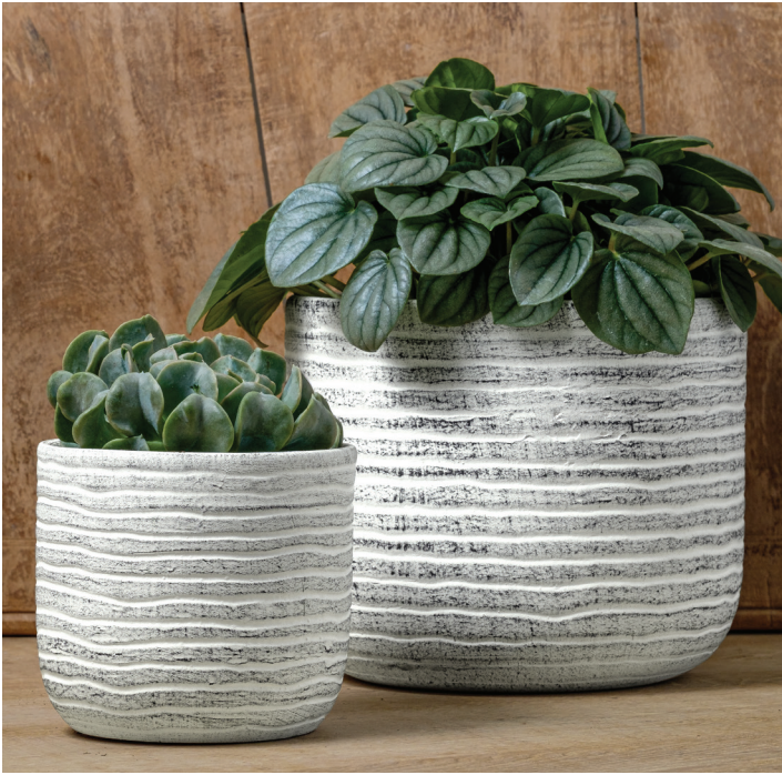
Shown in Dusty White