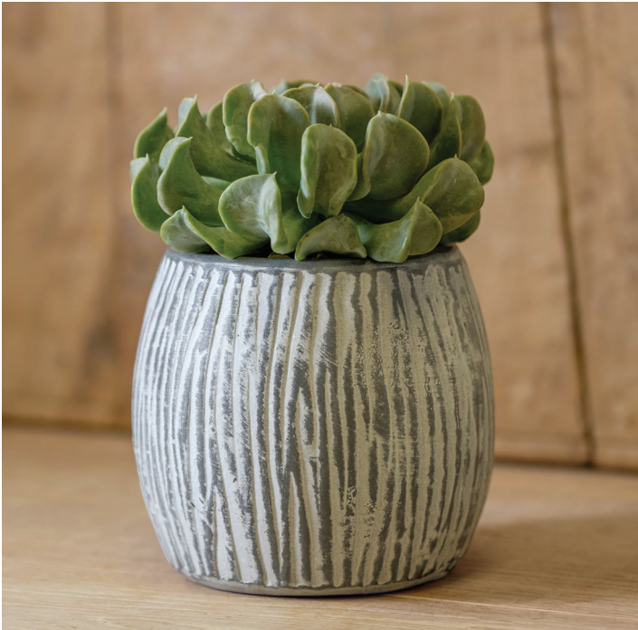
Shown in Grey and Whitewash