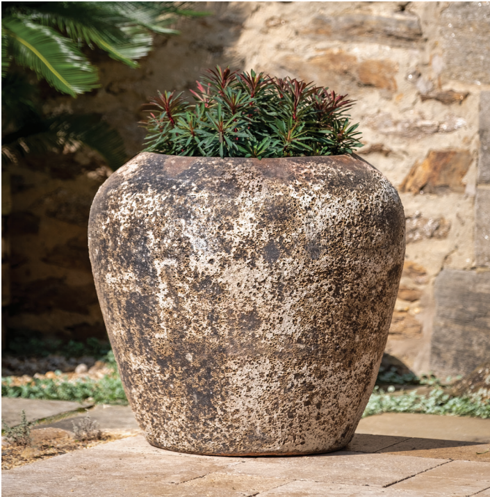
Shown in Aegean