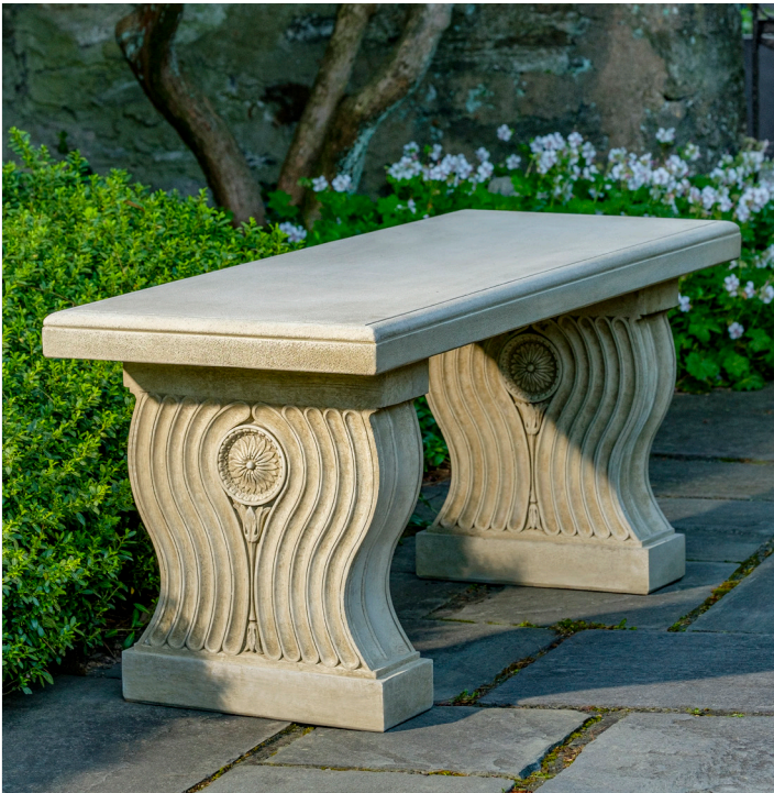
Shown in Verde