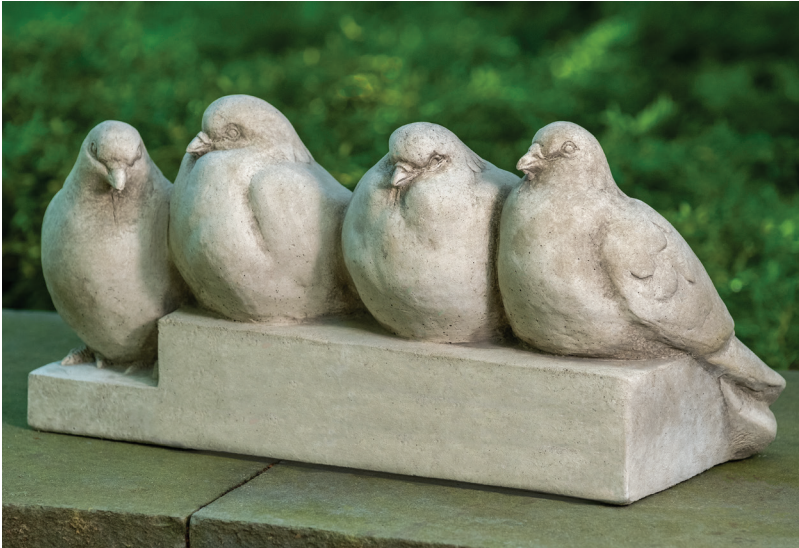
Shown in Verde