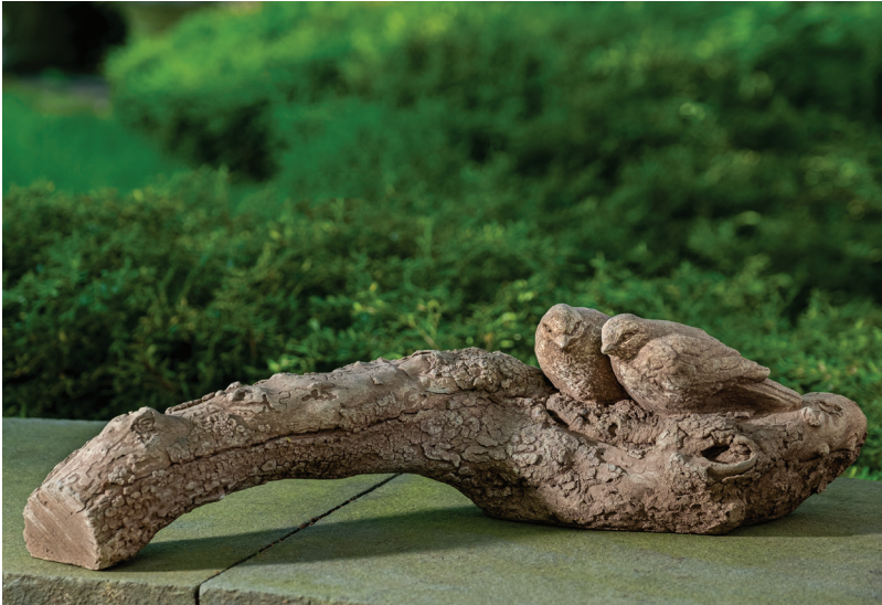
Shown in Brownstone