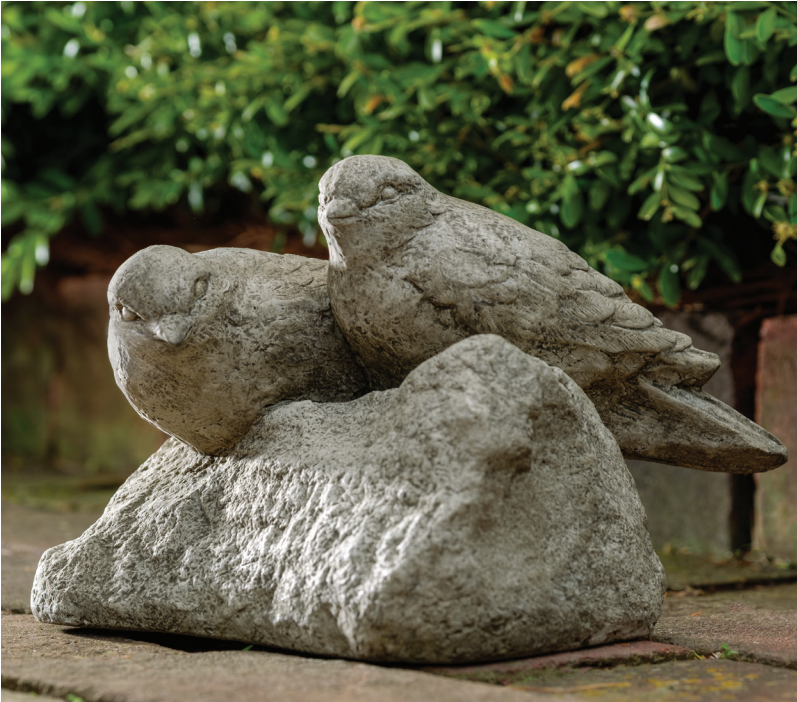
Shown in Greystone