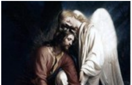
Angel ministering to Christ