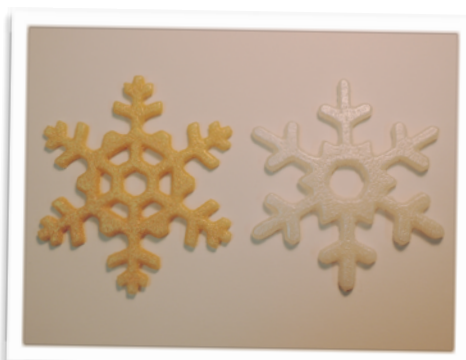
Mica powder is added to fine, Clear frit to created a metallic look. These are from the Snowflakes '14 design