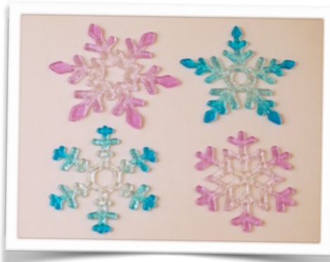
A bit of colored powdered frit at the tips really enhances the castings. These are Snowflake '12 and '13 castings