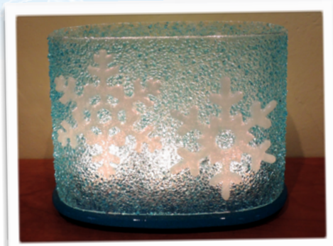
Oval Votive with Snowflakes '14 snowflakes