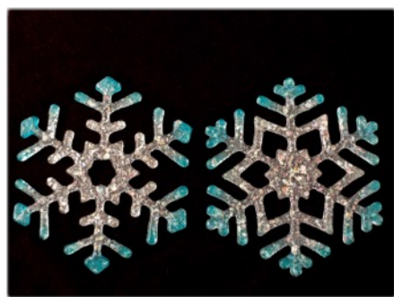
Snowflakes from the Snowflakes '16 design. This is the largest of the Snowflake designs

Place the mold in the kiln on an elevated shelf. Fire according to the “Snowy” Casting Schedule or the “Icy” Casting Schedule.