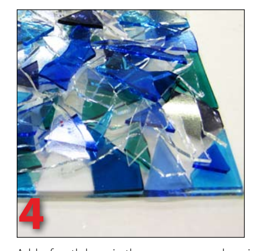
Add a fourth layer in the same manner, keeping glass at least 1/2-inch away from the edge to preserve shape when fused. Full Fuse. Slump into a deep mold for dramatic reflection. We used Slumpy's #005 Square Dropout.