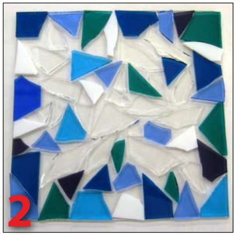
Spread KlyrFire on the Base. Beginning at the outer edges, place organically nipped pieces around the perimiter, then center. (Use Clear liberally to add "windows" and depth, use your Opal sparingly.)