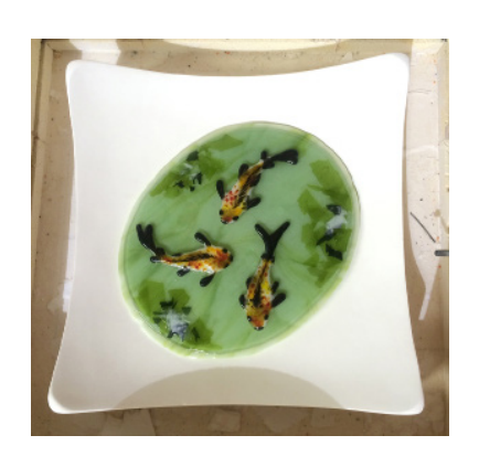
When the fused project has cooled, place the project on the GM132 XL Sushi from corner to corner as shown.