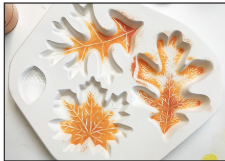
Sift Orange Opal over the Flame Opal and further out into the leaves.