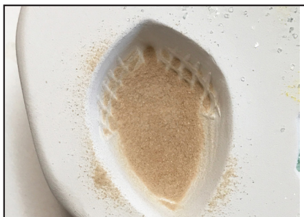
Sift F1 Chestnut over the Black.