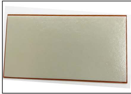
Cut a 6.75" x 12.75" piece of Vanilla Cream and a 7" x 13" piece of medium Amber. Clean the glass and then stack the Vanilla Cream on top of the Medium Amber. Place the stack on some thin fire paper and place in the kiln.