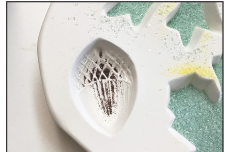
Sift Black Powder in the low areas of the acorn .