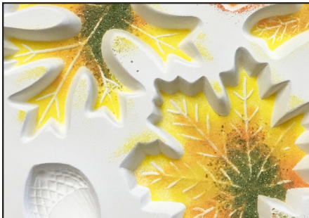
Place some Olive Green here and there in a couple of the leaves.