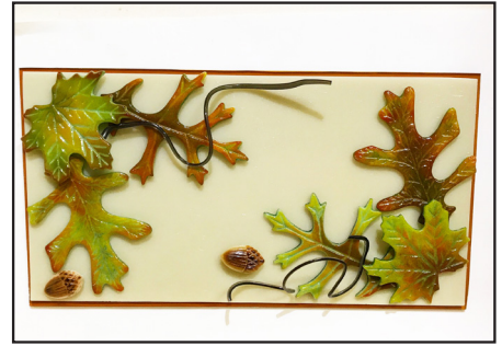
Arrange the leaves and acorns on the Vanilla Cream. Fire the glass using the schedule in table 2.