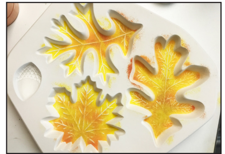
Sift Sunflower Opal over Orange Opal and further out into the leaves.