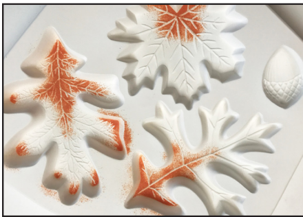
Sift Flame Opal in the leaf bases and along the veins of the leaves.

Creative Paradise Inc. "Where Creativity Takes Shape"