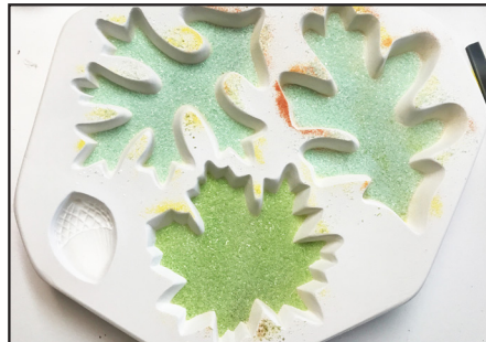
Place F2 Amazon Green, or Pastel Green, to fill each leaf cavity until they each hold 28 grams.