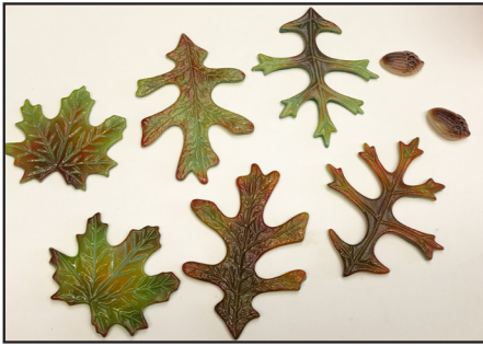
Two sets of leaves and acorns (made by using the mold twice).