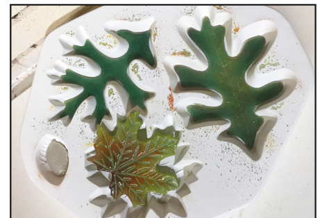
Fuse using the schedule in table 1.