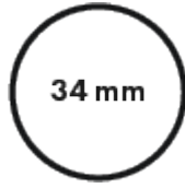
Main tube 34 mm