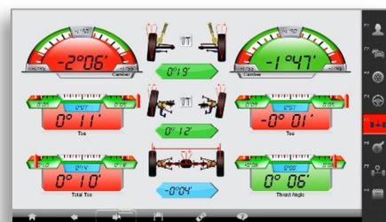
German Engineered 3D Alignment Software