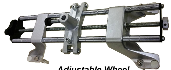
Adjustable Wheel Clamps 13" to 25"