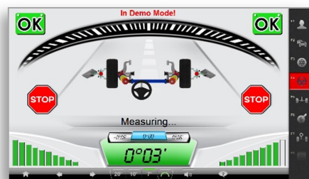
User-Friendly Screen Diagrams & Graphics