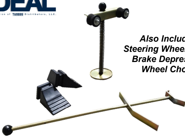
Also Included!! Steering Wheel Holder, Brake Depressor & Wheel Chocks