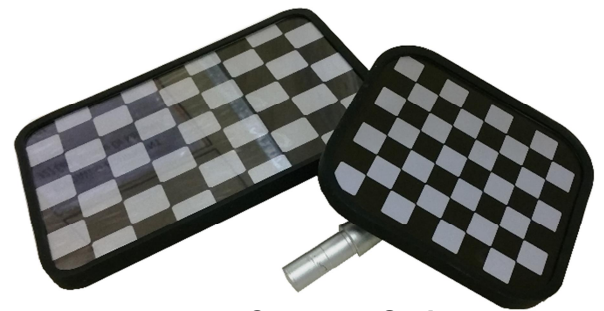
Compact Style Mini-Targets