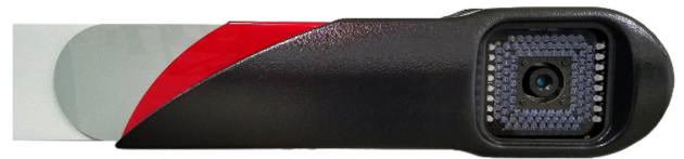
High Resolution 3D Industrial Cameras with LED Guide-On Assist