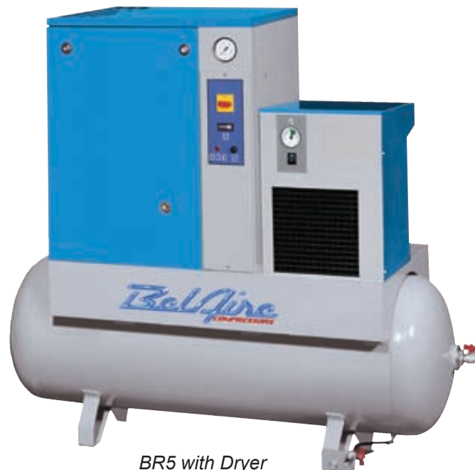
BR5 with Dryer