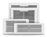
Flair Smart Vents