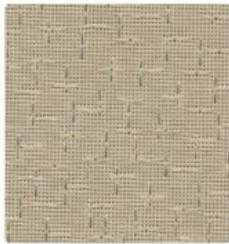
Avenue Park Place