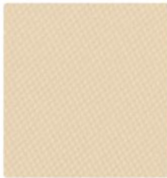
New England Providence