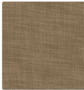
Cape Cod Provincetown