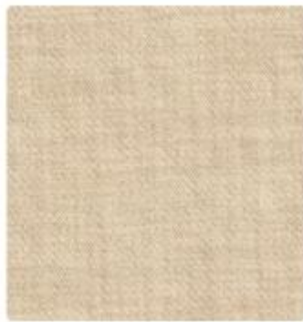
Cape Cod Nantucket