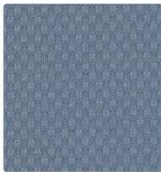
New England York