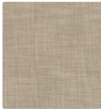
Cape Cod Hyannis