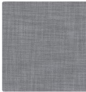
Cape Cod Chatham