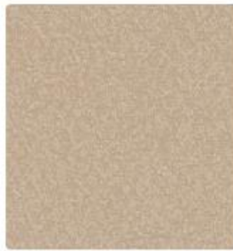
Stream Light Sand