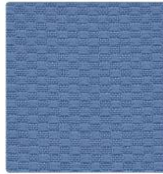
New England Lexington