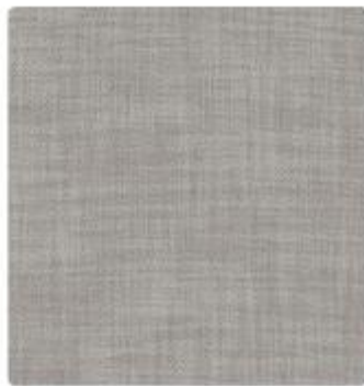
Cape Cod Harwich