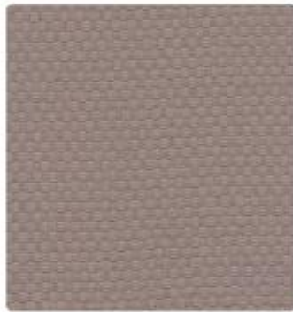
New England Hartford