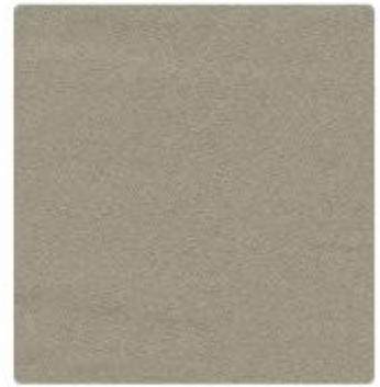
Simplicity Sandy Pebble