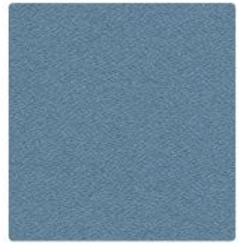
Simplicity Blue Smooth