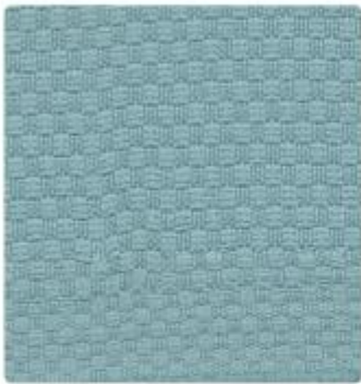
New England Dixville Notch