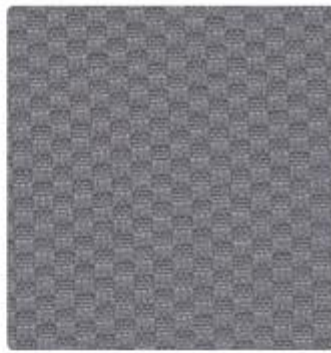
New England Cambridge