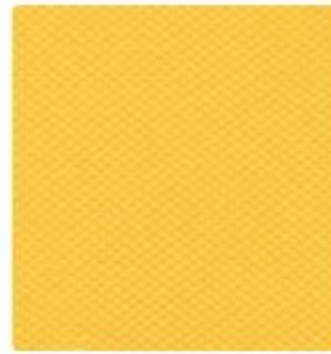
New England Rockport