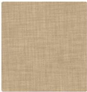
Cape Cod Martha's Vineyard