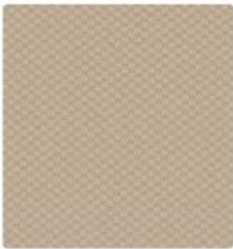
New England Newton