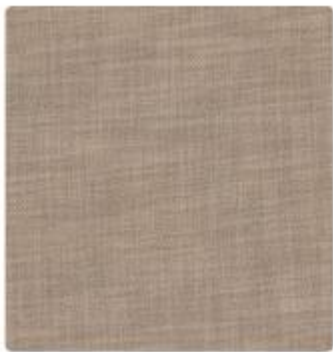
Cape Cod Falmouth