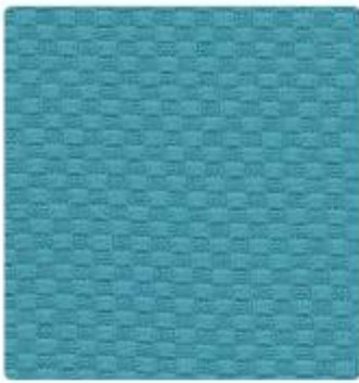
New England Boston