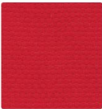
New England Salem