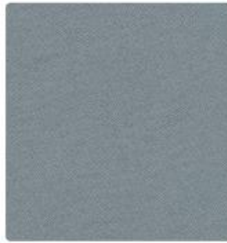
Simplicity Grey Blue