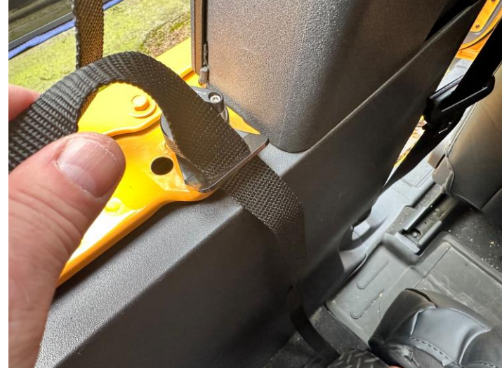
Step 6 At bottom of seat track (seats should be forward to see) Bend the tapered end of the lower strap so that it forms a little bend.