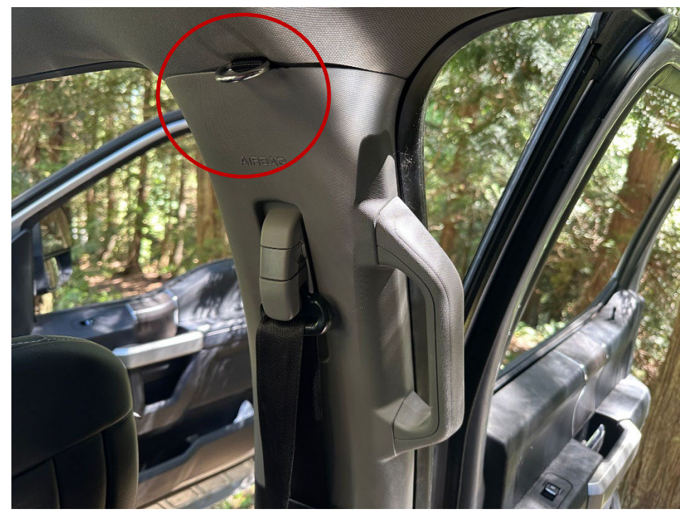
Step 11 Start to install the net starting at the top to the D rings at top of B pillar.