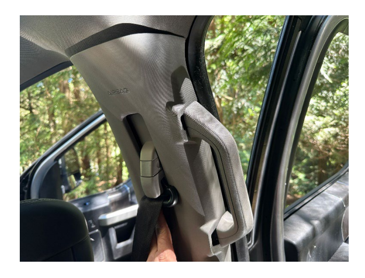
Step 10 Reinstall the lower panel in the same manner.

Double check clips are in line and the trim that goes under weatherstripping are properly lined up before pressing into place.