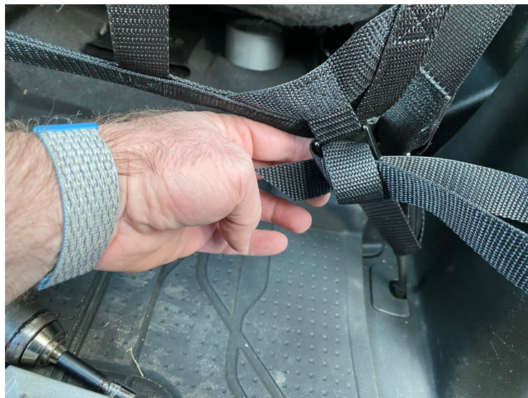
Step 14 All done. Your net should look like this Thank you for purchasing Raingler Nets. If you have any questions please contact us, we are here to help!