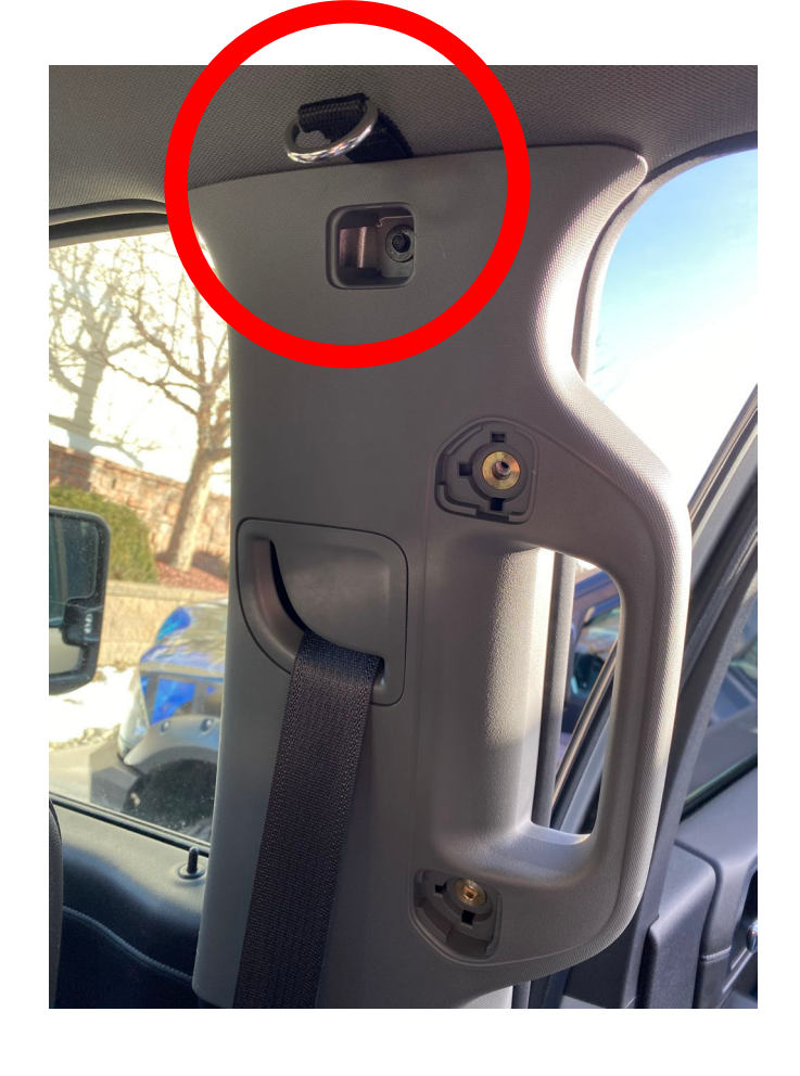
Step 9 Reinstall the remaining bolts in position. Double check that the seat belt strap as free and clear in operation:

Keep the tether and D ring strap pointed up.