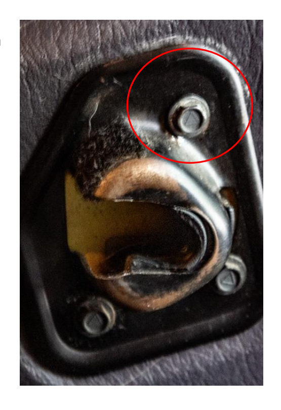
Step 4 Add the square ring to the REAR bolt (closest to cargo area). Tighten bolts

Fold rear seat forward. Remove upper rear bolt holding in seat latch.