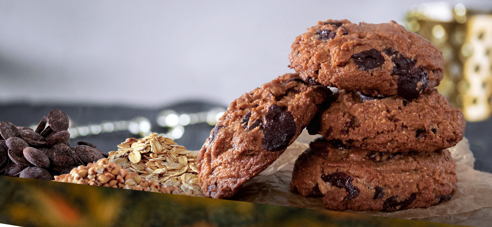
Vegan Oat & Buckwheat Chocolate Chip Cookie