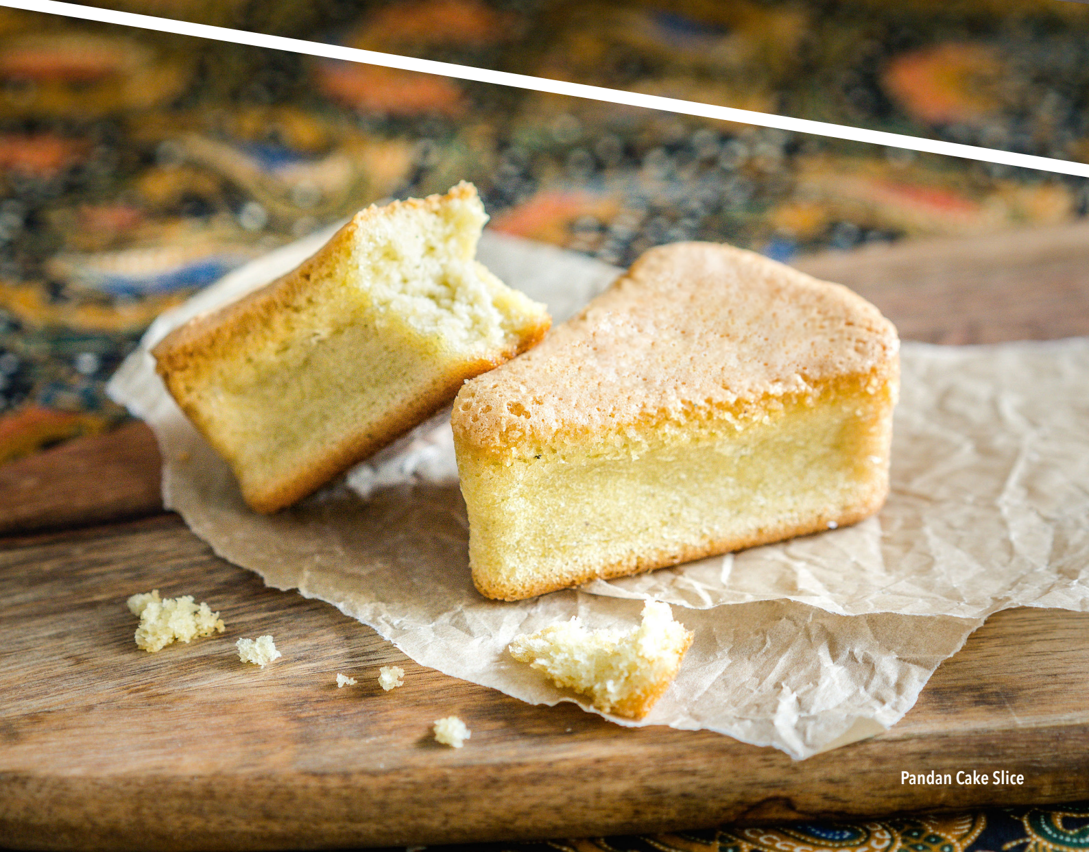
Pandan Cake Slice