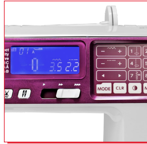
Easy Navigation and LCD Screen