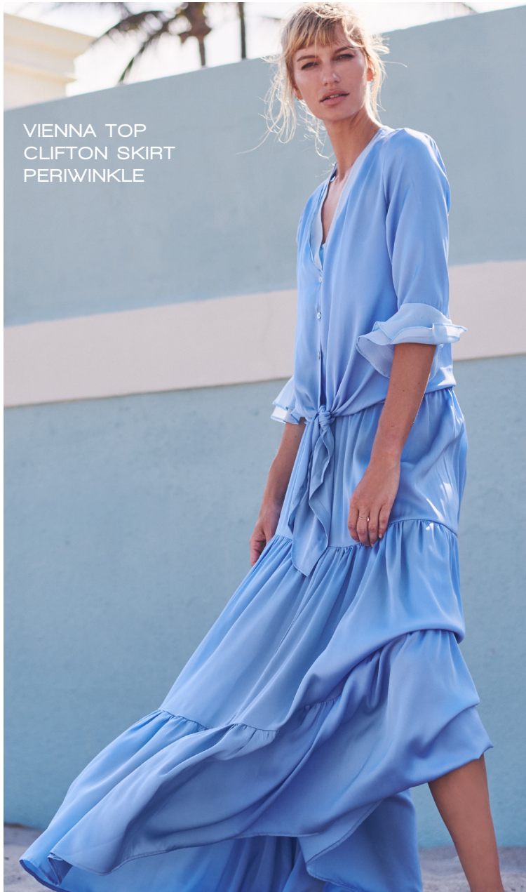
VIENNA TOP CLIFTON SKIRT PERIWINKLE