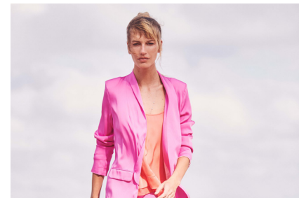
LA BLAZER HAVANA PANTS MIAMI PINK ZANZI CAMI ROSE