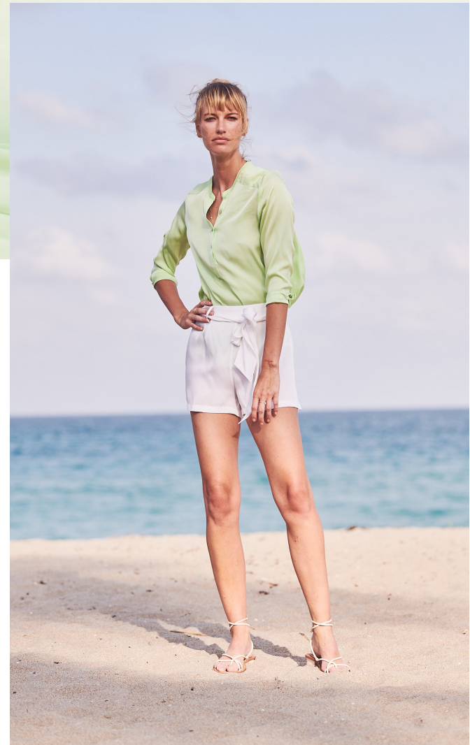
MONTENEGRO TUNIC SPRING GREEN SARASOTA SHORTS NOUVELLE WHITE