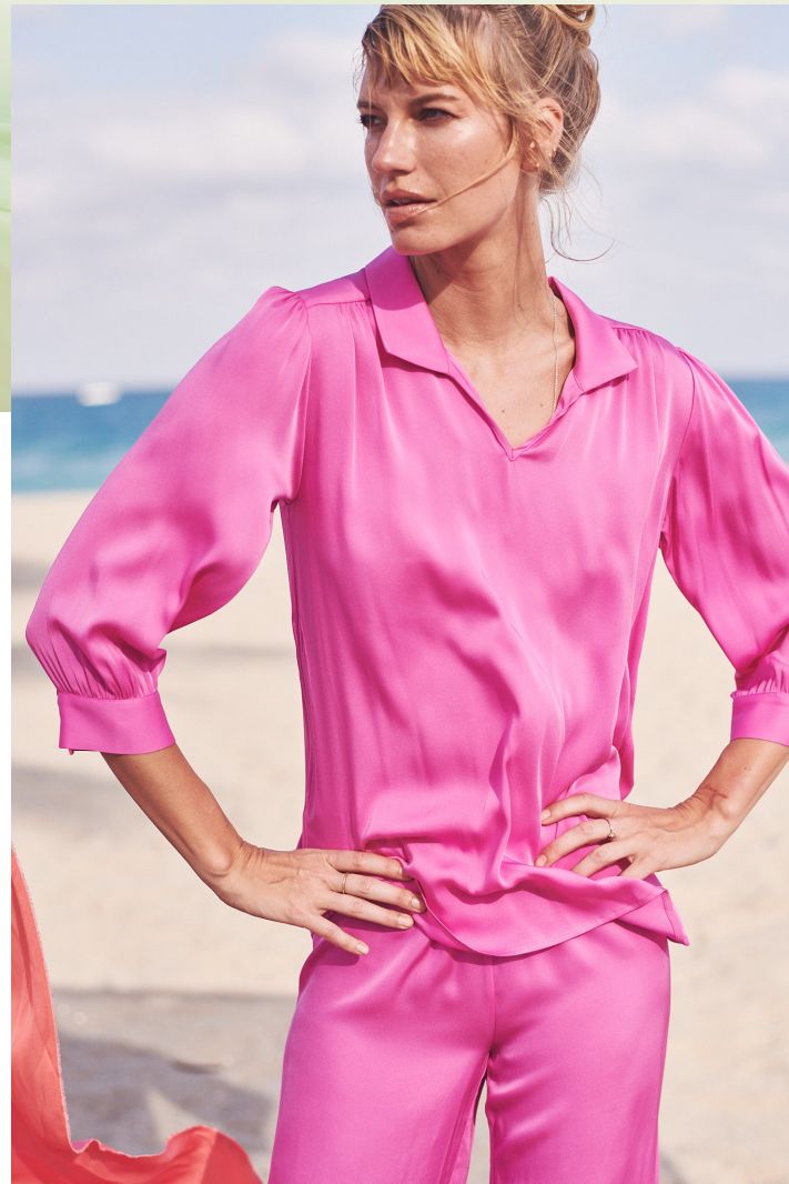
ST. LUCIA SHIRT HAVANA PANTS MIAMI PINK