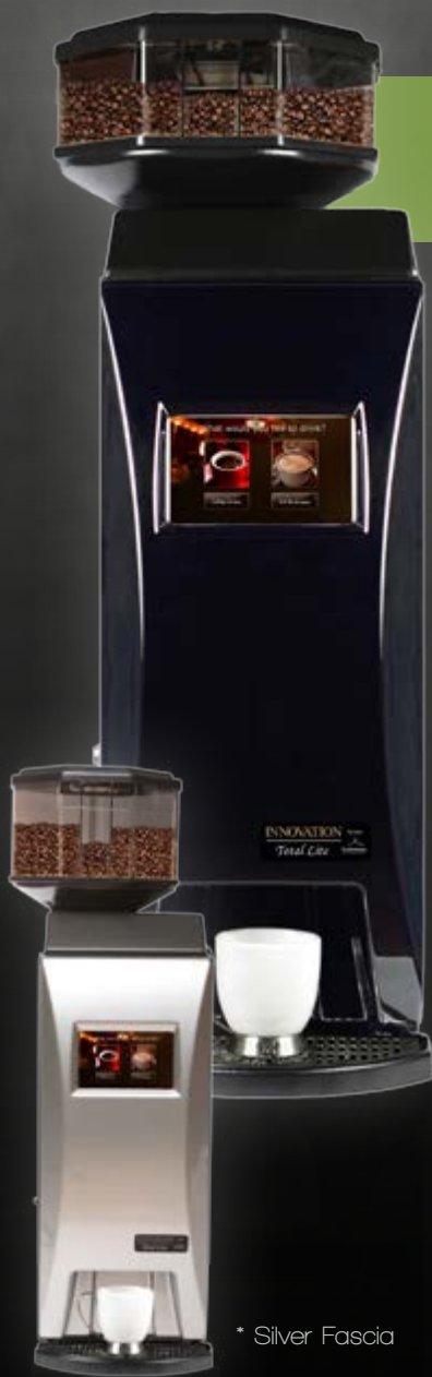
* Silver Fascia