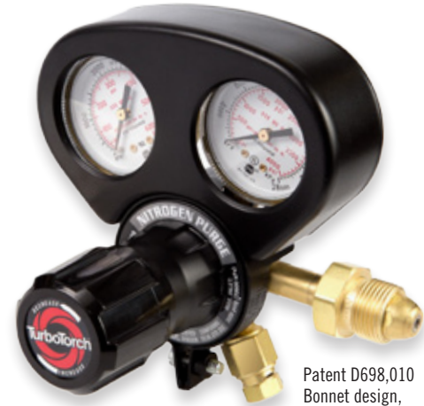
Patent D698,010 Bonnet design, G Series

Features improved low profile design, easy to grip knob, heavy-duty gauge guard and a patented high strength alloy bonnet (nearly twice the yield strength of brass).