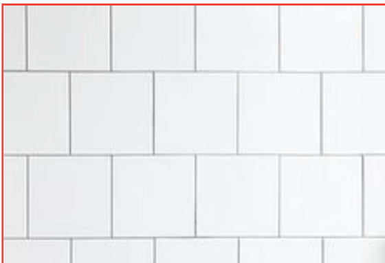
or a Brick Pattern .

We recommend using the brick pattern as it is much more cosmetically appealing. Over time your tiles move slightly, but the lines will always seem to remain even, unlike the checker pattern where slight movement can be easily detected making the floor look uneven.