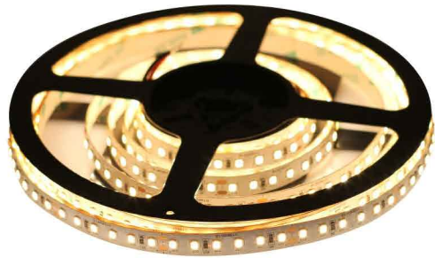
A. 16.4'(L) x 0.4"(W)