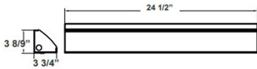
24 1/2"(w) x 3 8/9"(H) x 3 3/4"(D)