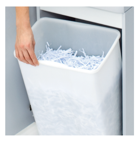
ENVIRONMENTALLY FRIENDLY BIN

Electronically controlled, transparent safety shield keeps fingers out of the feed opening.