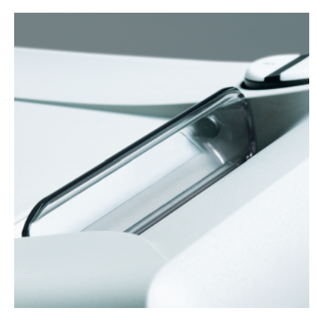
PATENTED SAFETY SHIELD

Multifunction control element uses optical signals to indicate operational status and functions as an emergency stop switch.