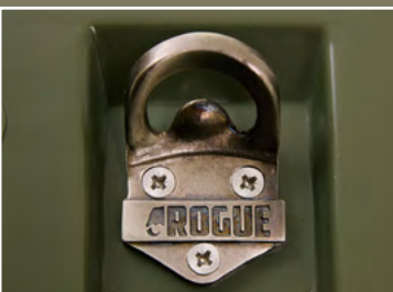
Cast iron bottle opener fitted underside lid as standard feature