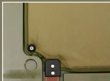
Padded canvas seat for added style and comfort. Military grade canvas.