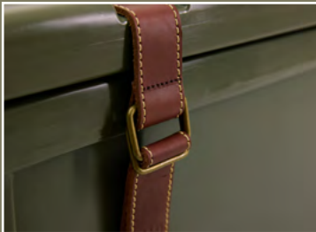
Bespoke leather handles and straps for quality, function and durability