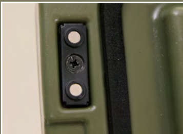
Rubber gaskets and magnetic lid seal in the cold