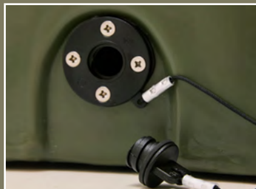
Drain plug with leash and leakproof rubber gasket