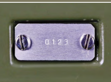
Individually numbered for quality control purposes