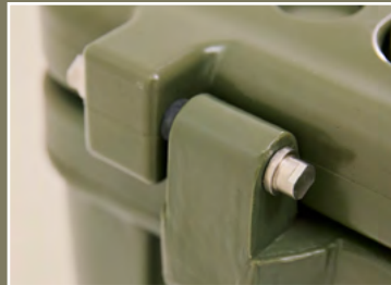
'Unbreakable' lid hinges moulded into box body with stainless steel pin