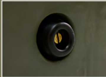
Rubber non-slip feet prevent sliding. Feet interlock for easy stacking