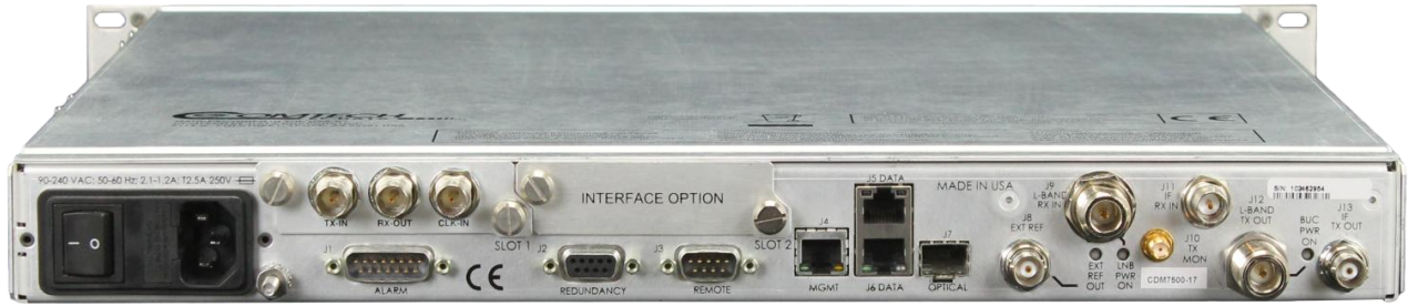
CDM-760 Back Panel