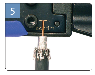
Ensure cable is prepared to 1/4" x 1/4" dimensions. Use guage on VT tool to recheck center conductor.