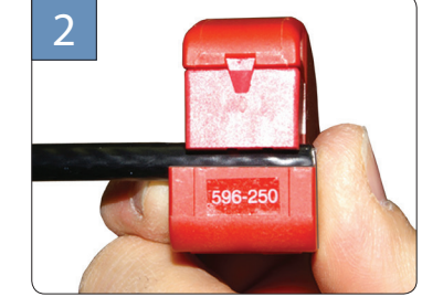
Using a fixed blade, prep tool in good condition, prepare cable to 1/4" x 1/4" dimensions. Use edge of tool if no stop