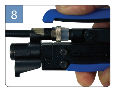
Using your VT-200 compression tool, make sure the rotating compression head is positioned for 6/59 as shown in the picture. Porperly seat connector and compress fully.