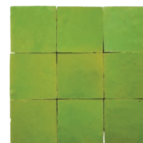
avocado zellige tile 4", $19 per square foot, ziatile.com