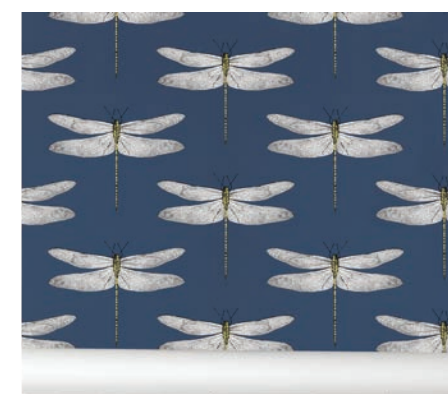
harlequin demoiselle wallpaper $198 per roll, decoratorsbest.com