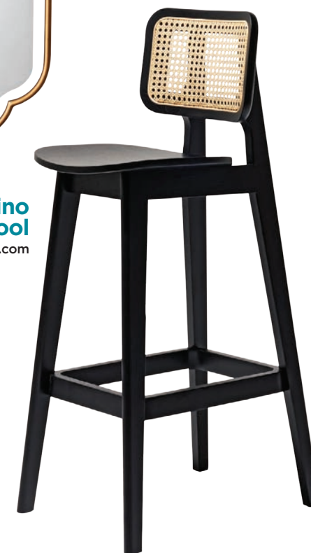
domino counter stool $595, industrywest.com