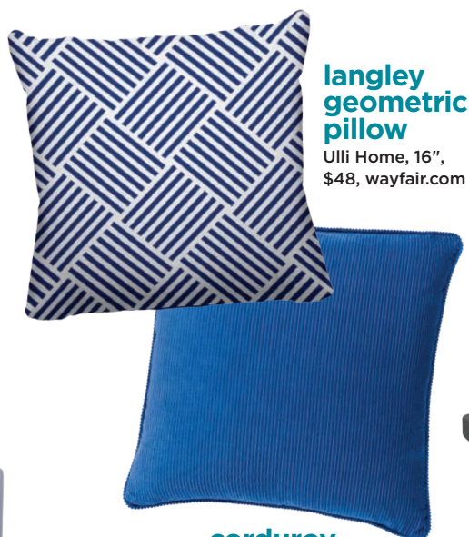
corduroy pillow cover Surya, 18", $25, burkedecor.com