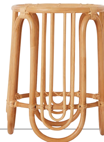
rainbow stool 17½" tall, $198, burkedecor.com