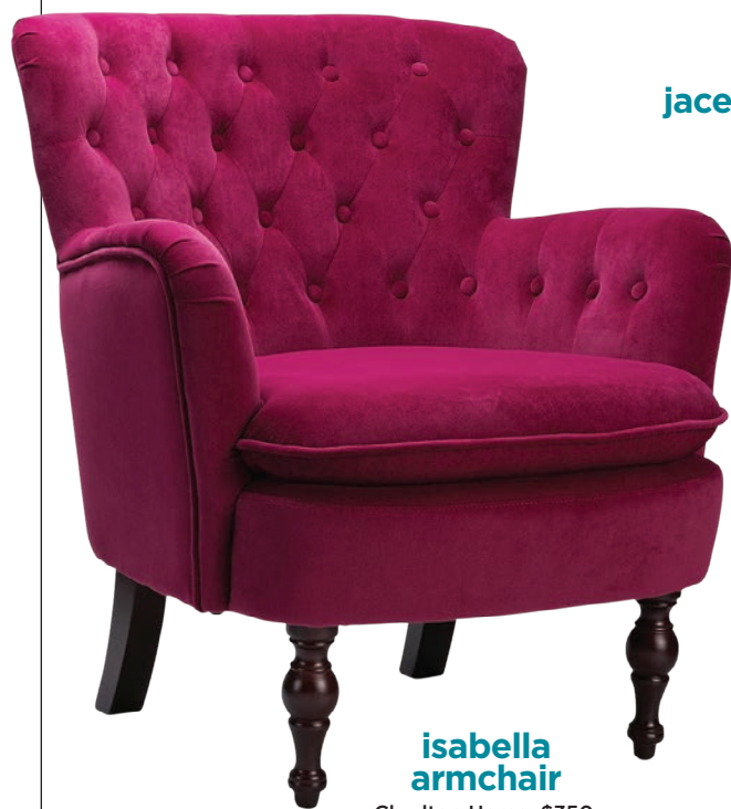
isabella armchair Charlton Home, $350, wayfair.com