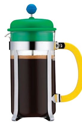
bodum caffettiera french press $25, store.moma.org