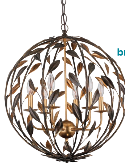
broche english chandelier 21" dia., $900, lampsplus.com