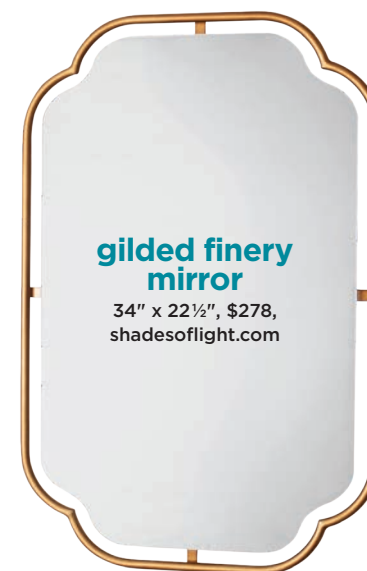
gilded finery mirror 34" x 22½", $278, shadesoflight.com