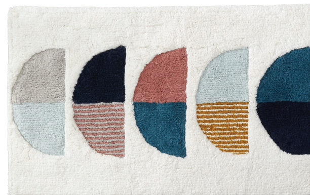
half moons bath mat $40, westelm.com