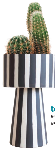
toppu pot 9½" tall, $89, goldenagedesign.com