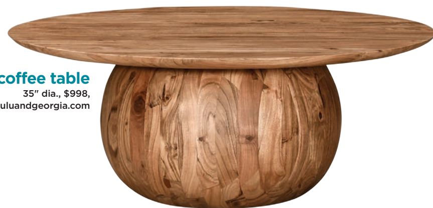
jace coffee table 35" dia., $998, luluandgeorgia.com