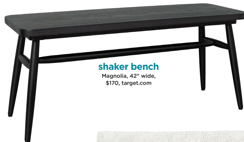
shaker bench Magnolia, 42" wide, $170, target.com