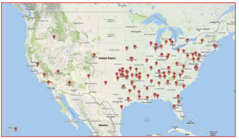
VISIT OUR WEBSITE TO FIND STATIONS IN YOUR AREA OR WRITE TO US TO REQUEST A CURRENT LIST BE MAILED TO YOU