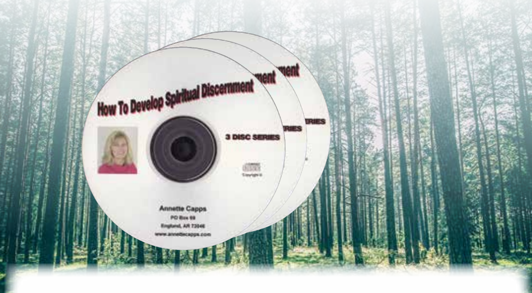
Hearing God's Voice and developing spiritual discernment is a skill which you can learn.

Always trust the Holy Spirit inside of you and proceed with caution if "things don't seem just right." All external experiences should be checked and compared with the witness of your spirit. God has given us supernatural protection, a guide into the truth, if we only listen. Pay attention!