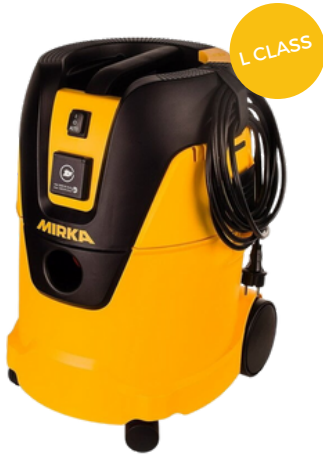
1025 L PC Dust Extractor SKU: 8999080111

This development places higher requirements on the dust extractors. Mirka's range of dust extractors and accessories meet the demands of the market and of the health and safety authorities.