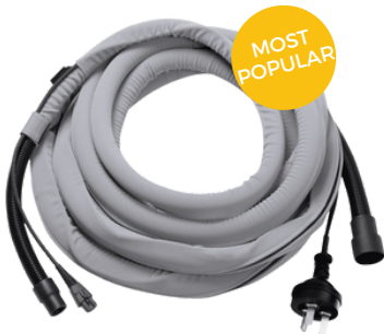
Dust Extractor Hose, Sleeve, Cable - 10m SKU: MIE6515611AN