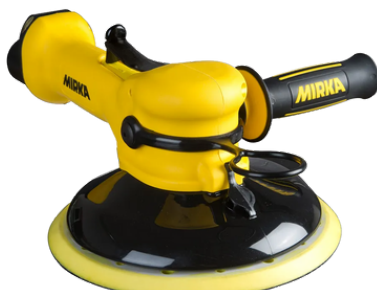
ROS2 850CV 200mm Central Vacuum Sander SKU: 8994850111