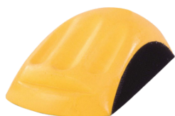
Sanding Block for 150mm Grip Discs SKU: 8390330111