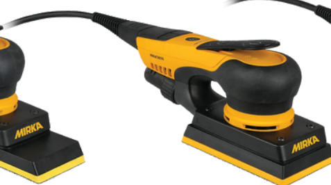
Deos 353CV - 81x133mm Sander, 3mm Orbit SKU: MID3530201AN