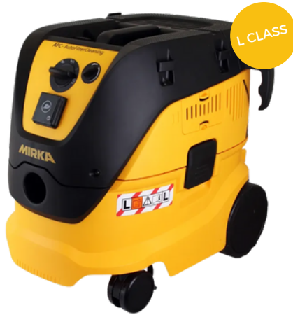
1230 L PC Dust Extractor SKU: 8999180111