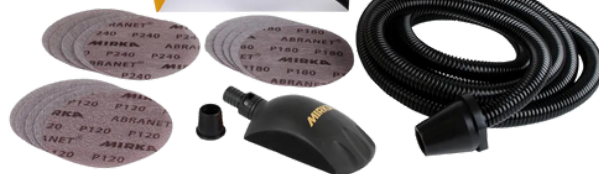
Roundy Hand Sanding Block Kit SKU: KIT00ROUND