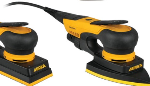
Deos Delta 663CV - 100x152x152mm Sander SKU: MID6630201AN