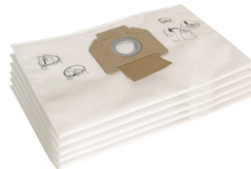
Fleece Dust Bags for DE 1230 Single: 8999100211-1 5 Pack: 8999100211