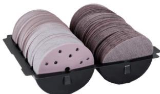
Case Inlay for 150mm Sanding Discs SKU: 8996535011