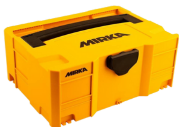
Standard Case SKU: MIN6532011 Suitable for storing sanders