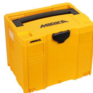
Extra Deep Case SKU: MIN6535011 Suitable for polishing gear