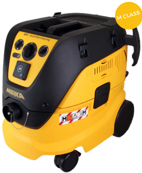
1230 M AFC Dust Extractor SKU: 8999228111

Today, health and safety issues are becoming increasingly important. Sanders and abrasives are made more and more efficient, with focus on dust-free applications.