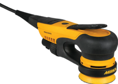
Deros 350CV - 77mm Sander, 5mm Orbit SKU: MID3502011AN