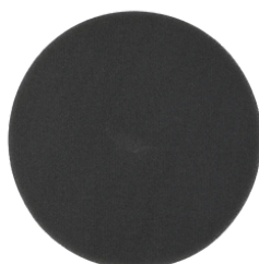
Abralon 77mm Disc 125mm Disc 150mm Disc