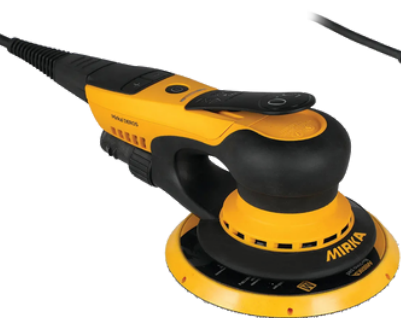
Deros 650CV - 150mm Sander, 5mm Orbit SKU: MID6502022AN