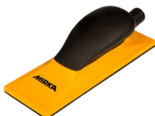
Hand Sanding Block 70x198mm - 22 Hole SKU: KIT001HAND