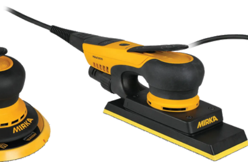
Deos 383CV - 70x198mm Sander, 3mm Orbit SKU: MID3830201AN