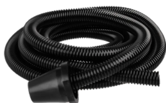
Hose for Hand Sanding Blocks SKU: 8391112011