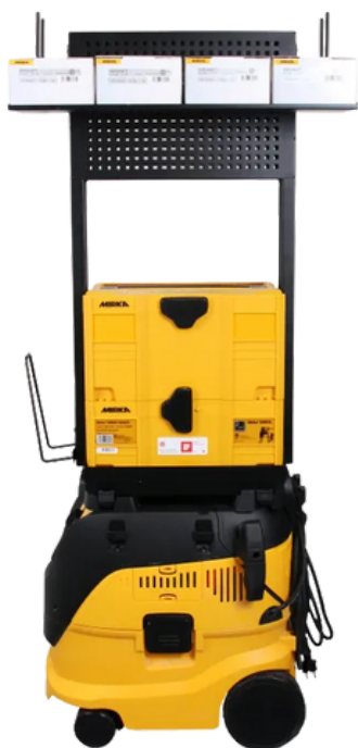
Work Station for DE 1230 SKU: 9190148011