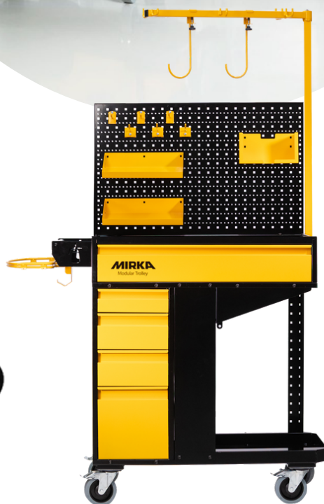
Modular Trolley Premium SKU: KITMODTROLL5