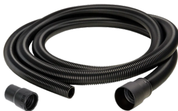
Dust Extractor Hose - 4m SKU: MIN6519411