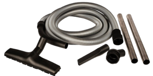
Clean Up Kit SKU: 8999799111