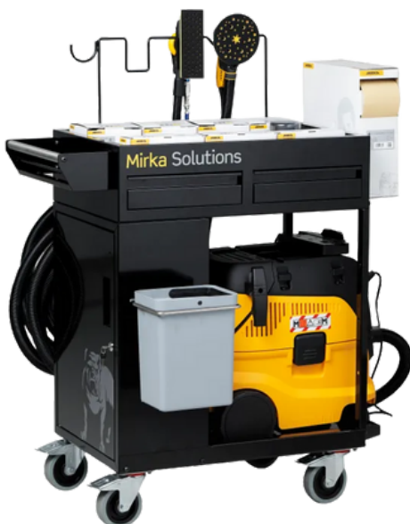
Solution Trolley SKU: 9190129001