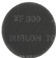
Mirlon Total 150mm Disc