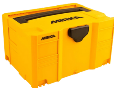
Deep Case SKU: MIN6533011 Suitable for storing abrasive discs