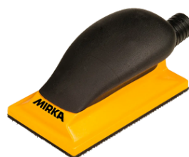
Hand Sanding Block 70x125mm - 13 Hole SKU: 8391400111