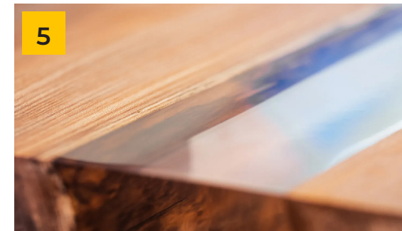
5 Finish the surface with an oil of your choosing.