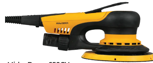
Mirka Deros 650CV 150mm, 5mm orbit