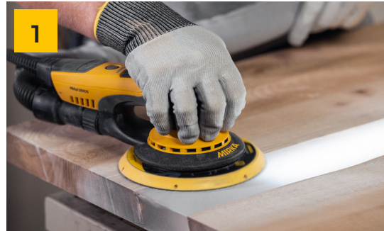
1 Sand the whole table using Galaxy 150mm Sanding Discs in 120 grit, then 180 grit using the Mirka Deros Random Orbital Sander with 5mm Orbit.