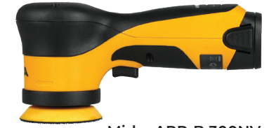
Mirka ARP-B 300NV 77mm, Rotary