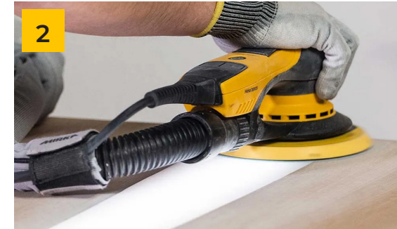
2 Sand the resin section using Galaxy 320, 600, 1000 and lastly 1500 grit.