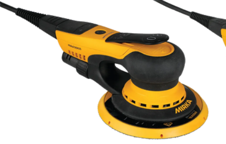
Deros 680CV - 150mm Sander, 8mm Orbit