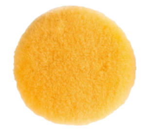
Lambswool Polishing Pro Pad