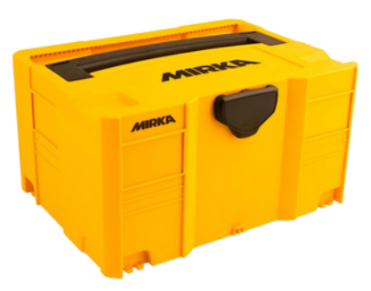
Deep Case SKU: MIN6533011 Suitable for storing abrasive discs