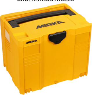
Extra Deep Case

SKU: MIN6535011 Suitable for polishing gear