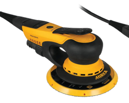
Deros 650CV - 150mm Sander, 5mm Orbit