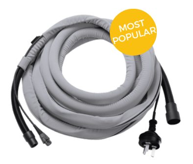
Dust Extractor Hose, Sleeve, Cable - 10m