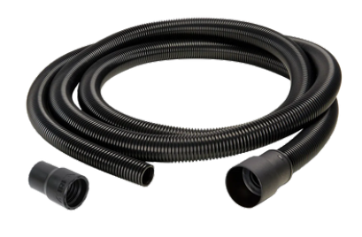
Dust Extractor Hose - 4m SKU: MIN6519411