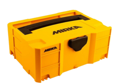
Standard Case SKU: MIN6532011 Suitable for storing sanders