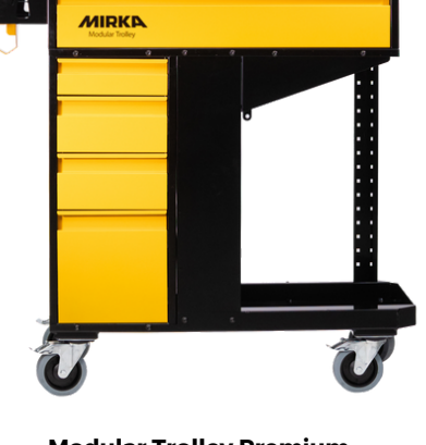
Modular Trolley Premium