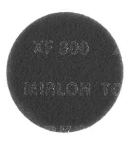
Mirlon Total 150mm Disc

77mm Disc 150mm Disc 70x70mm Roll 115x230mm Roll