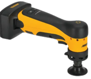
Angos ARG-B Cordless Grinder, 55mm