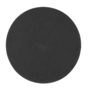
Abralon J3 Sanding Disc