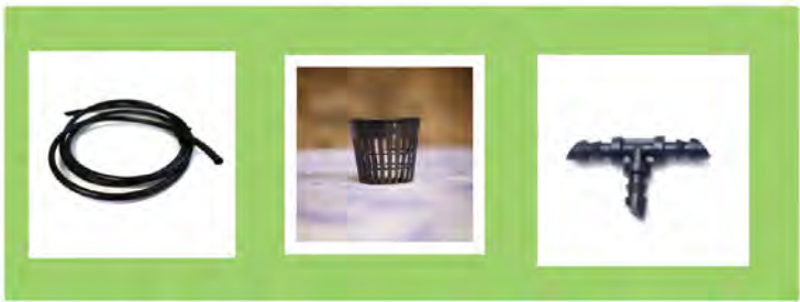
1/4" Solid Poly Micro Tubing (PE) For Drip Irrigation System