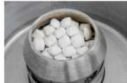
Stone base with lava stone for even heat distribution