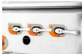
3 level of setting to manipulate flame power