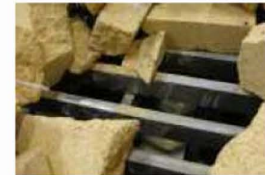
Cast iron grating with brick pieces for even heat distribution