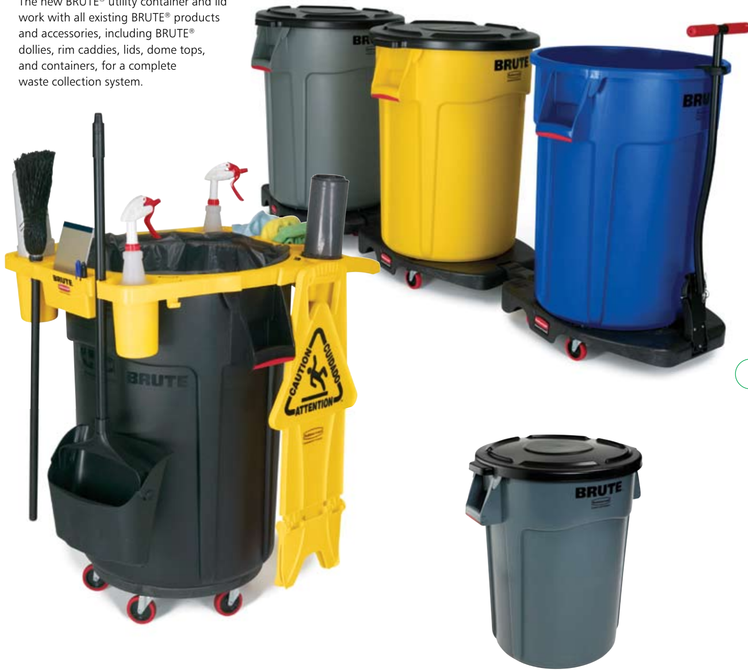
2643-60 Container with 2645-60 Lid

The new BRUTE® utility container and lid work with all existing BRUTE® products and accessories, including BRUTE® dollies, rim caddies, lids, dome tops, and containers, for a complete waste collection system.