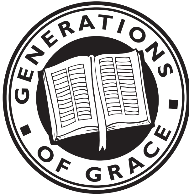
ILLUSTRATION BOOK YEAR 2

Text: Copyright © 2016. Generations of Grace. All Rights Reserved. Illustrations: Copyright © 2016. Chad Frye. All Rights Reserved. ( www.chadfrye.com )